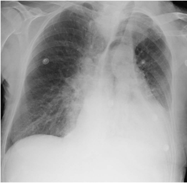
Fig. 1. Chest x-ray before fiberoptic bronchoscopy showing left lower lobe consolidation with an ipsilateral mild pleural effusion.